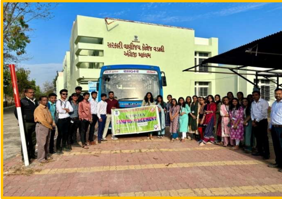
Photo Gallery of Placement Fair on 06/03/2023